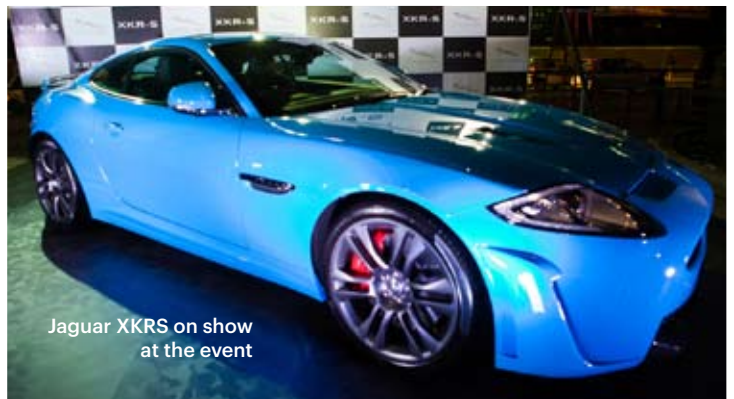
Jaguar XKRS on show at the event