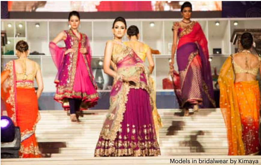
Models in bridalwear by Kimaya