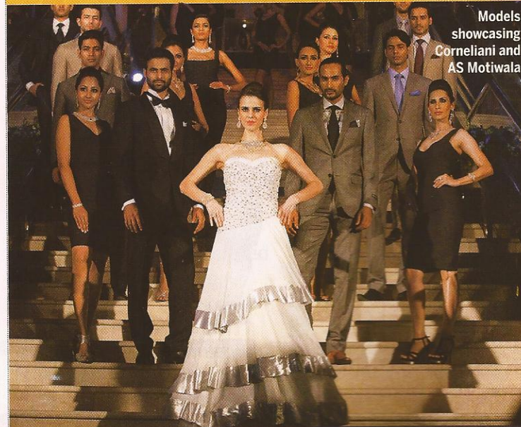
Models showcasing Cornelian and AS Motiwala